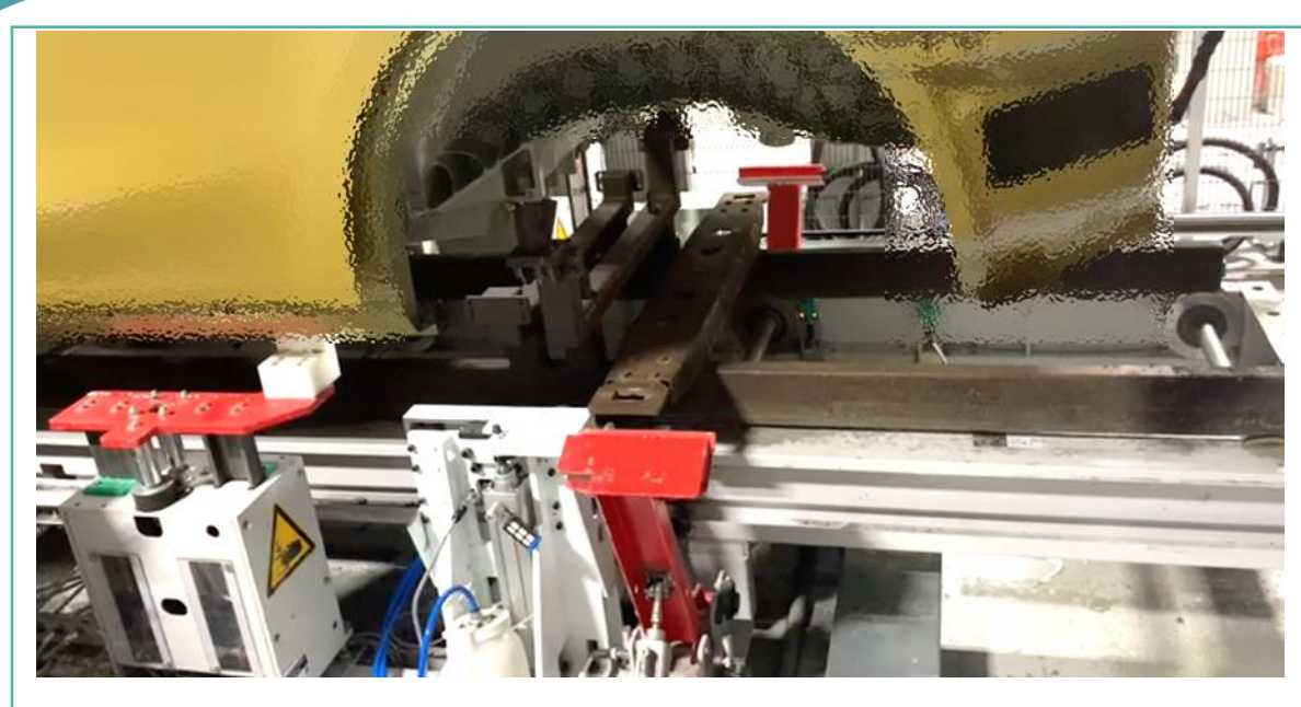
Nut-runner installed in assembly line